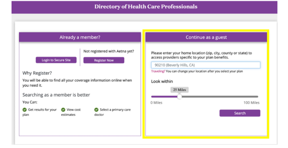
Step 2: Select a network: